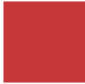
Pantone 180 CP