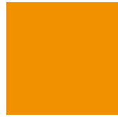
Pantone 715 CP