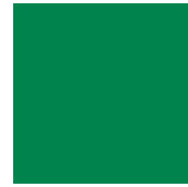
Pantone 3415 CP