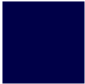
Pantone 2766 CP