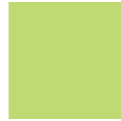
Pantone 374 CP