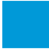
Pantone 2925 CP