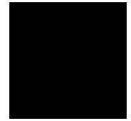
Pantone Black CP